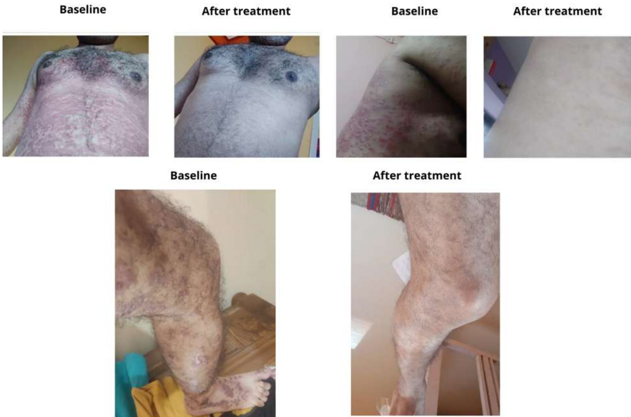
Fig. 2. Baseline through follow-up changes in the psoriatic lesions of cases 3 and 4.