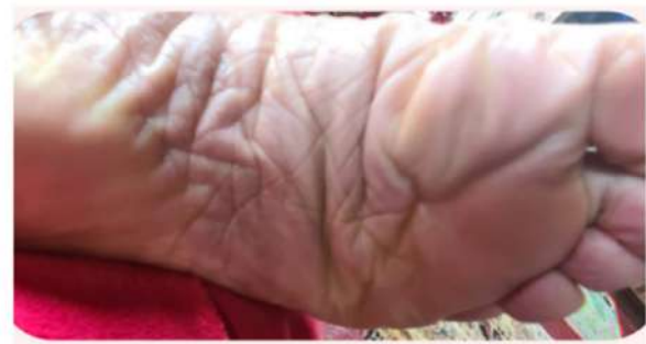
Fig. 3. Baseline through follow-up changes in the psoriatic lesions of cases 5 and 6.

levels at 26 pg/mL. She was put on 30,000 IU vitamin D3 daily, but as her BMI was > 35, the vitamin D3 dose was increased to 40,000 IU within a week. The dose was further increased to 50,000 IU daily after 30 days. PTH values checked after 2 months of therapy, showed a marginal reduction from 26 pg/ml to 22 pg/ml, indicating a high degree of vitamin D resistance. The ionized calcium levels were maintained in the normal range. Therefore, from the third month, the vitamin D dose was further increased to 60,000 IU daily with strict restriction of calcium rich foods. PTH checked after a month of 60,000 IU daily was 19 pg/ml and ionized calcium levels within normal range.