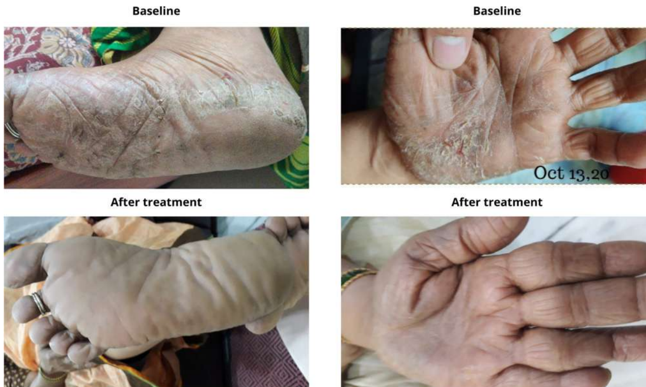
Fig. 1. Baseline through follow-up changes in the psoriatic lesions of cases 1and 2.