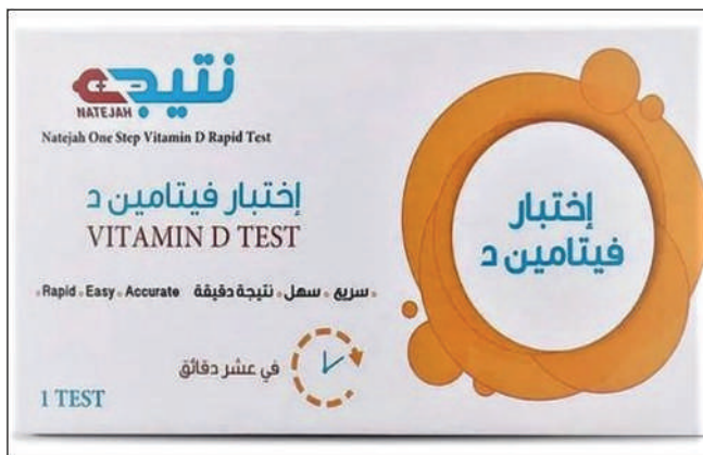
Figure 1: Vitamin D rapid test (Natejah)

1) Pregnancy or lactation; 2) systemic diseases that have the potential to alter the clinical status of the periodontal system and the metabolism of bone, or that require premedication prior to monitoring or treatment procedures, 3) treatment for periodontal disease in the previous six months.