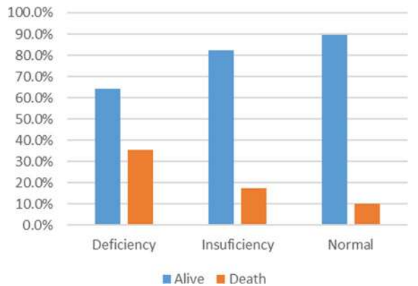
Fig. 2 Comparison of Mortality Rates in Three Groups of VDD, Vitamin D Insufficiency, and Normal Vitamin D