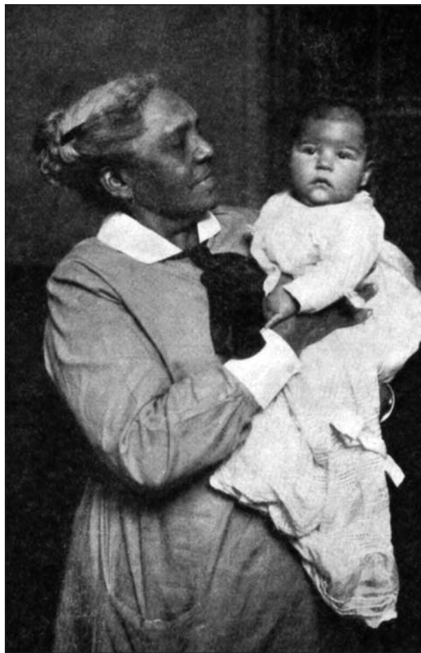
Figure 3. An African American visiting nurse holding an African American infant. Photograph from the Visiting Nurse Service Report for 1923, administered by the Henry Street Settlement. Courtesy of Henry Street Settlement Archives, University of Minnesota Libraries, Minneapolis.

1 (n=32) was compliant for 6 months, and each infant had an average cumulative total of 54 oz (1620 mL) of cod liver oil. Although treatment group 2 (n=5) was also compliant for 6 months, the average cumulative intake of cod liver oil per infant was lower (23 oz [690 mL]). Infants belonging to treatment group 3 (n=12) were compliant for only 4 months, and the average cumulative intake of cod liver per infant was 21 oz (630 mL). The control group comprised the 16 noncompliant infants who took no cod liver oil at all.