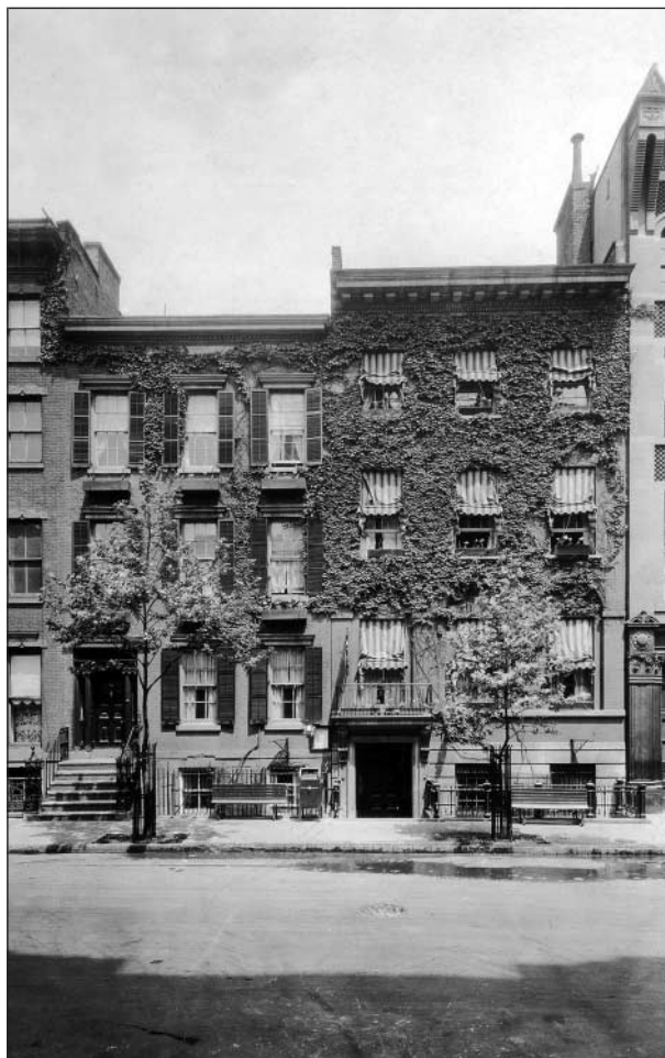
Figure 2. An early photograph of Henry Street Settlement.

Sixty-five infants, 1 to 17 months of age, were studied for a 6-month period between December 1916 and June 1917. A visiting nurse familiar with the community helped the researchers access recruited patients in their homes throughout the study ( Figure 3 ). Most of the enrolled infants had siblings with rickets at the time of recruitment. Patients were clinically assessed