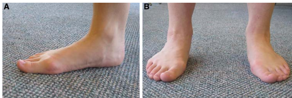
Fig. 1 Hyperpronation of subtalar joint. a Medial, b anterior views.

Muscle imbalance and inflexibility, especially tightness of the triceps surae (gastrocnemius, soleus, and plantaris muscles), is commonly associated with MTSS [1, 7, 8].