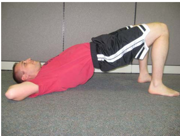
Fig. 2 Pelvic bridge exercise to strengthen gluteal core muscles.

Examining patient’s shoes may reveal generally worn-out shoes or patterns consistent with a leg-length discrepancy or other biomechanical abnormalities. Abnormal gait patterns should be evaluated with the patient walking and