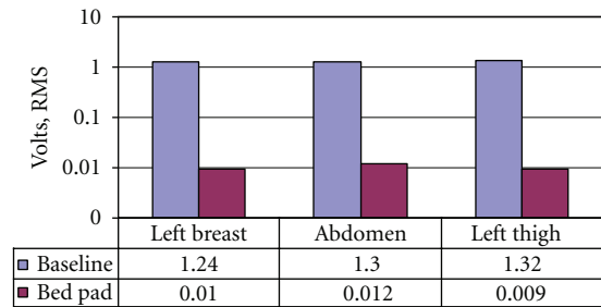
FIGURE 2: Effect of bed pad grounding on 60 Hz mode.

Each method (patch and sheet) immediately reduced the common alternating current (AC) 60 Hz ambient voltage